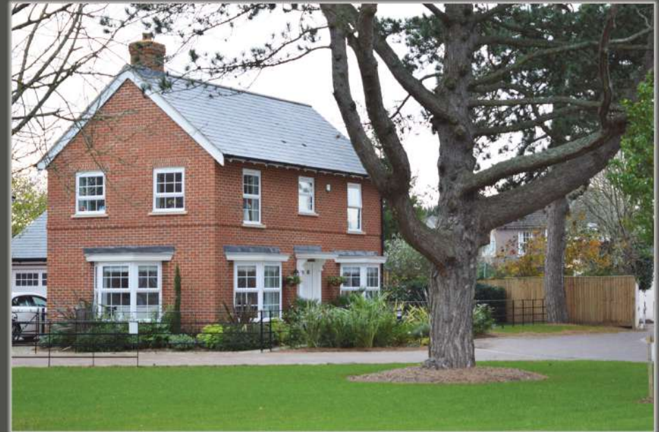
Croudace Developments site - Nightingale Court in Romsey, Hampshire

The Esco 402 quarry is situated near the village of La Bana in the mountains of the province of Leon in Spain. In these mountains where cows and horses roam freely, slate first started being extracted over 40 years ago by a local family. The family business has grown and is now one of the biggest and most reliable quarries in the area and 40 years later the quarry now produces roofing slate with the latest technology and an environmental ethos second to none.