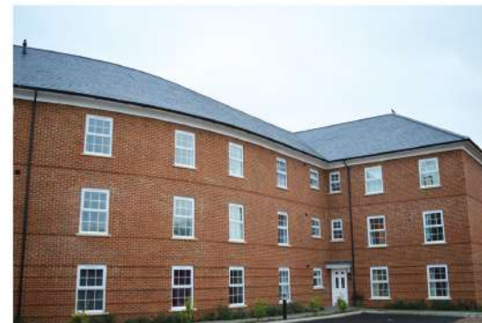
ESCO402 used on a curved roof

An allowance should be made for cutting and wastage.