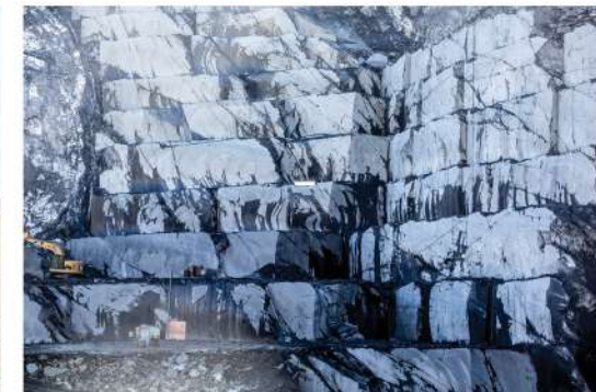
Slate being extracted from the quarry